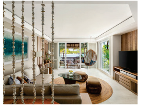
Frangipani One Bedroom Suite - Living Room