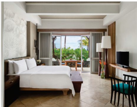
Shangri-La One Bedroom Suite - Bedroom