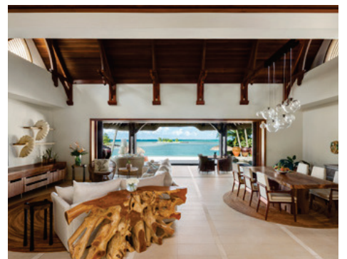
Shangri-La Three Bedroom Beach Villa - Living room