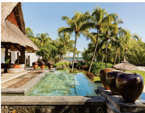
Shangri-La Three Bedroom Beach Villa - Terrace