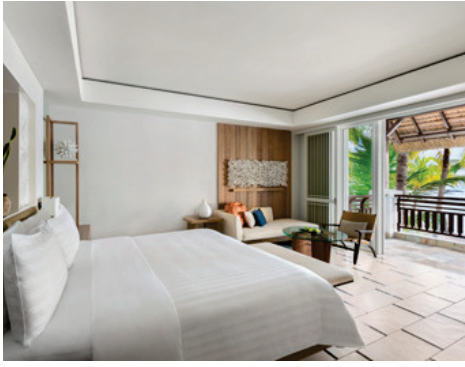
Junior Suite Hibiscus Ocean View