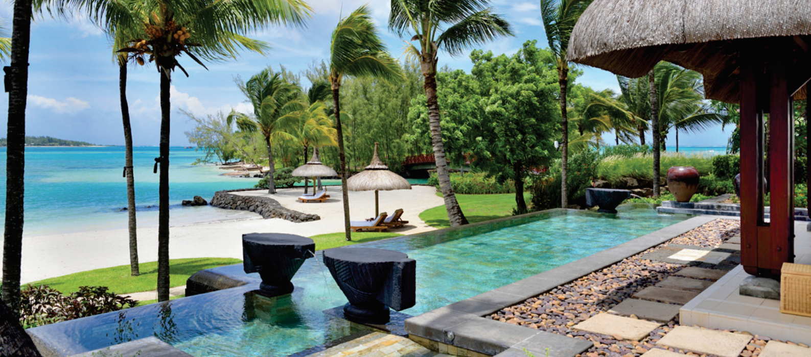
Shangri-La Three Bedroom Beach Villa