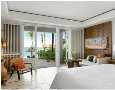
Junior Suite Frangipani Club Beach Access