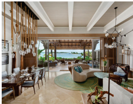
Shangri-La One Bedroom Suite - Living Area