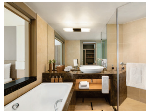
Deluxe Coral Room - Bathroom