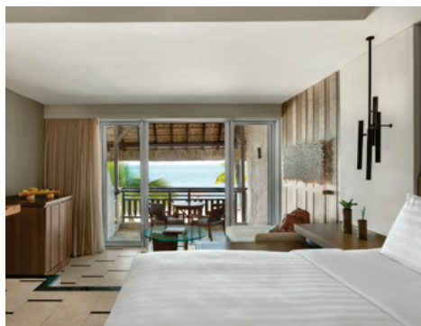
Deluxe Coral Room Ocean View