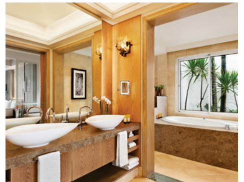
Shangri-La One Bedroom Suite - Bathroom