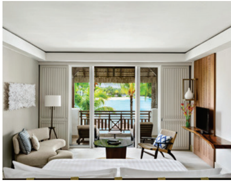
Frangipani One Bedroom Suite - Bedroom