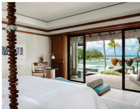
Shangri-La Three Bedroom Beach Villa - Bedroom