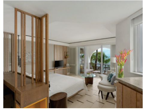
Junior Suite Frangipani Club Ocean View