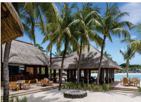
Republik Beach Club & Grill