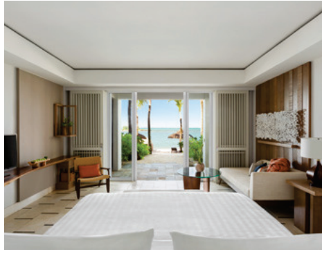
Junior Suite Hibiscus Beach Access