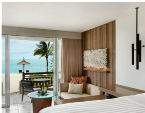
Deluxe Coral Room Beach Access